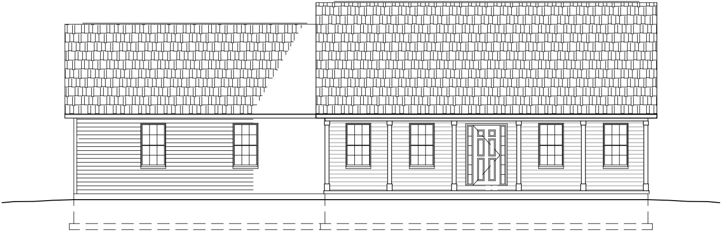
1 FRONT ELEVATION A-1